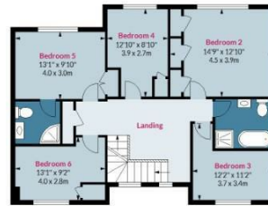
First Floor Floor Area 974 Sq Ft - 90.48 Sq M