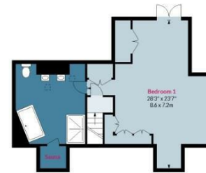
Second Floor Floor Area 706 Sq Ft - 65.59 Sq M