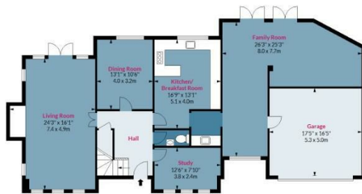
Ground Floor Floor Area 1675 Sq Ft - 155.61 Sq M